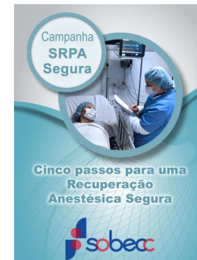
Figure 1, 2 – Posts of Campaign