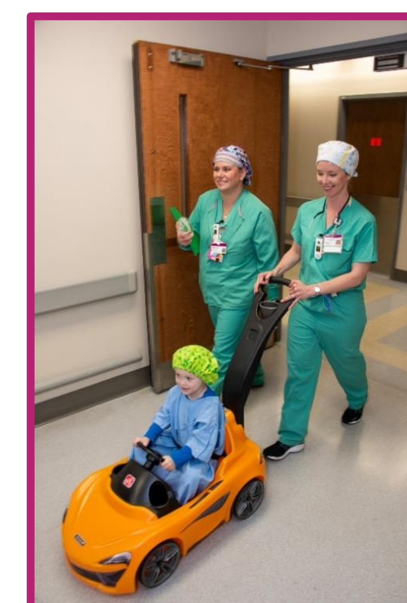
Pediatric patient being transported to the OR