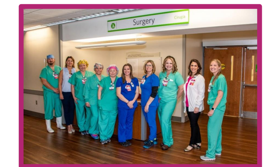
OMH Perioperative Staff