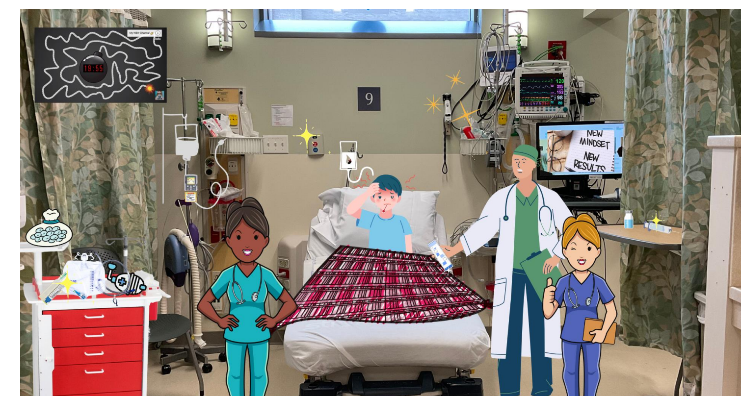
Fig. 1 Perianesthesia virtual escape room

Implementation: This evidence-based multidisciplinary project aimed to improve recognition and intervention of MH protocol. Utilizing virtual escape rooms allows for subtle prompts in critical reasoning for the learner to protocolize the treatment plan for MH. The treatment of MH requires a series of steps to achieve stabilization of the perioperative patient. Identifying clear roles and responsibilities in a virtual space creates effective team building, clear communication and ultimately improves patient outcomes as identified by pre and post intervention survey.