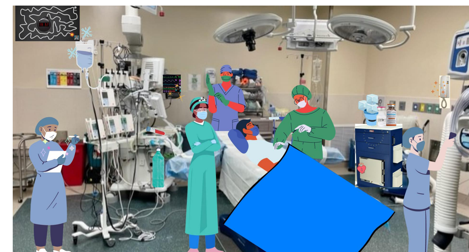
Fig. 2 Perioperative virtual escape room