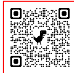
Fig. 1. Survey to capture unit issues/concerns