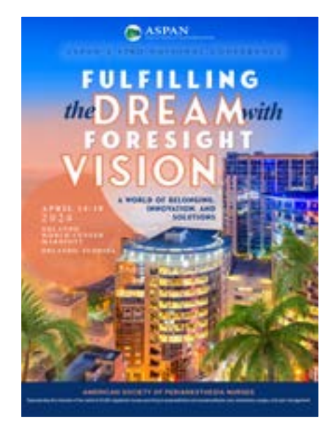
43<sup>rd</sup> National Conference April 14-18, 2024 Orlando, FL