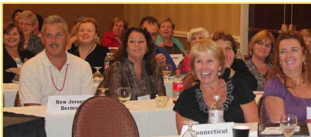
A Mock RA provided some education and levity