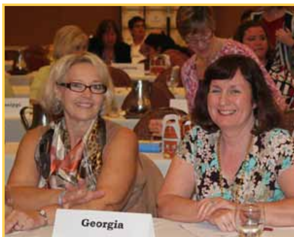
Georgia Representatives cast a ballot at the Mock RA