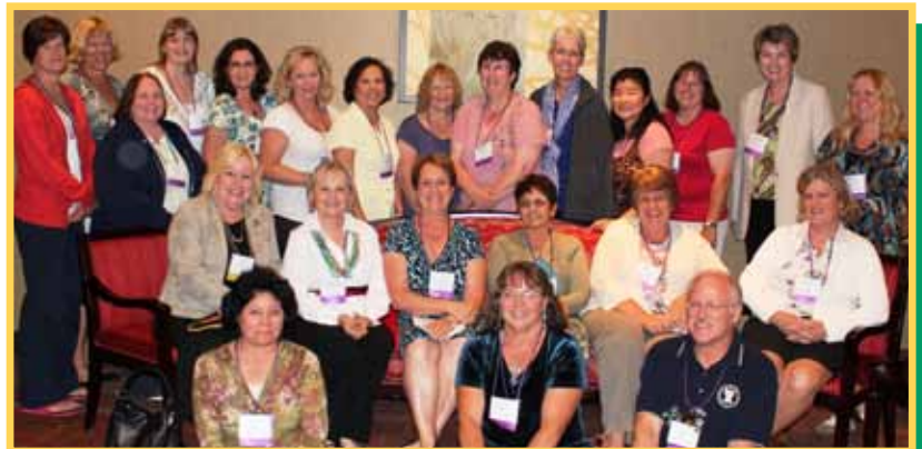
Region 1 leaders gathered in Philadelphia at the 2011 ASPAN CDI

NPANA ( www.npana.org ) had a successful conference in Vancouver, Washington, this year. It offered 12 contact hours in 1.5 days; boy, they had lots of topics! The board has been busy attending CDI and starting preparation for next year's conference in Anchorage, Alaska ... before the snow, we hope!