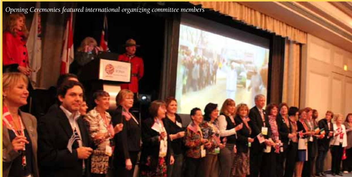
Opening Ceremonies featured international organizing committee members