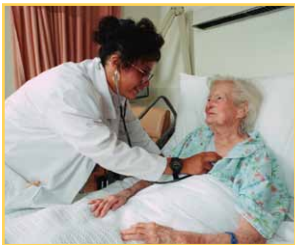
The elderly is one vulnerable population identified to have poor health literacy

H ealthy People 2010 defines health literacy as the ability to, “obtain, process, and understand basic health information and services needed to make appropriate health decisions.” 1 Patients frequently make important decisions regarding their health, but, for some, reading medication labels or deciphering a physician’s instructions is a challenge.