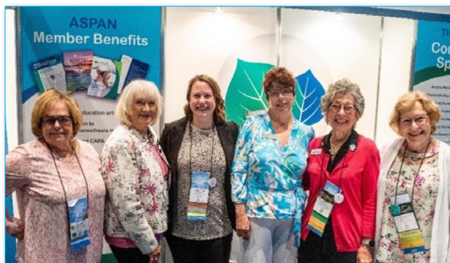
▲ Can we answer your questions?