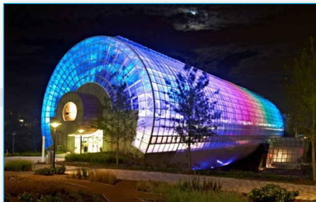
▲ City Center – Myriad Gardens