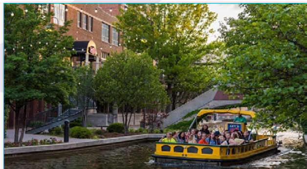
▲ Bricktown Canal