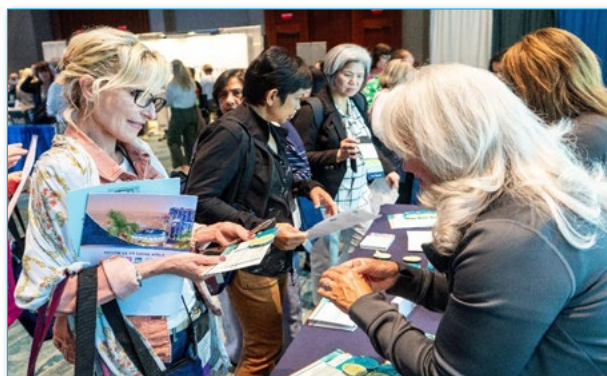
▲ Attendees speaking to vendors in the Exhibit Hall

We also want to thank the 21 components and many corporate sponsors for their support this year. Please see the complete list of corporate and component sponsors on page 14. Special thanks to everyone who donated to, and assisted with, the Silent Auction and manning the ASPAN booth. We couldn't have done it without you!