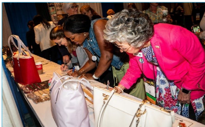
▲ The Silent Auction was always buzzing with activity!

The Silent Auction featured 91 items donated by individuals and components. This was a record number of items for a few years! The bidding activity was for the three days, culminating on Wednesday morning with folks hovering and placing their final bids to secure the item of their choice. The Silent Auction raised $5,007 for Development to fund scholarships, awards, and clinical inquiry. This was also a record amount not seen in the last few years!