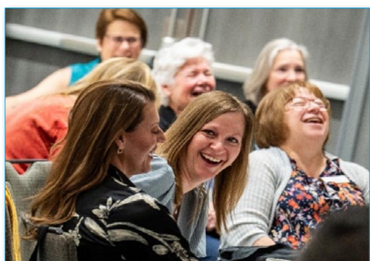
▲ Laughing hysterically during the humor presentation