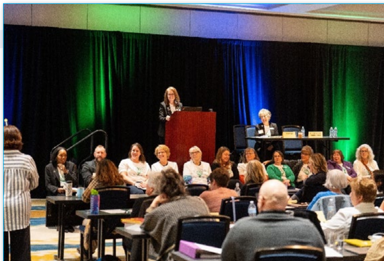
▲ ▼ PDI attendees participated in an animated mock Representative Assembly